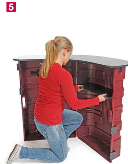
5 Attach the 4 inner shelves by inserting into the slots in the case.