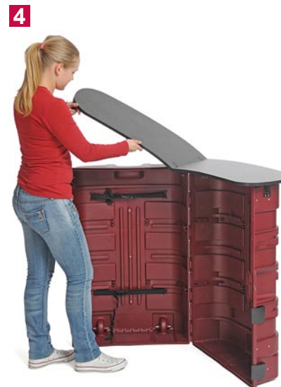
4 Unfold the counter top to the left side. Align and lock in place with the two latches, as in the previous step.