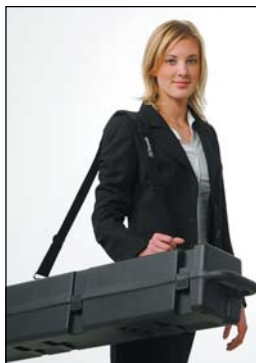
A shoulder strap is available as an accessory.

A new hard case on wheels is now available for easy and safe transport of the BannerUp and its valuable graphics. Send it by truck, or check it in at the airport – no problems!!