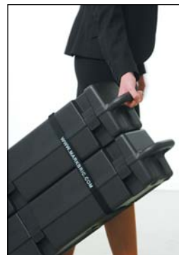
2 or 3 cases can be connected during transport with our tightening straps.