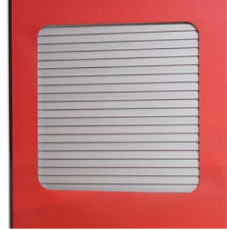
With graphic panel cut out