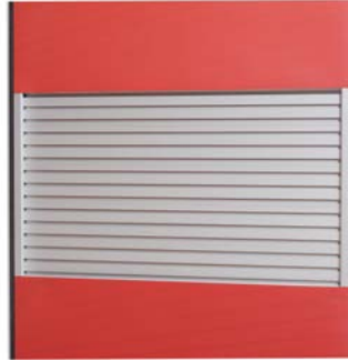
With corner trims