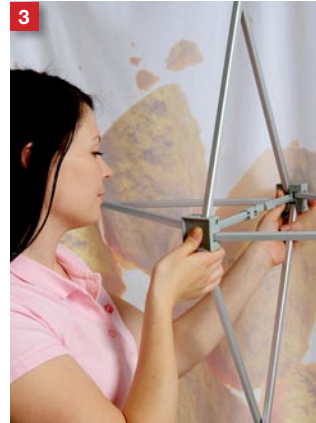
3 Lock all hubs, press all hubs together