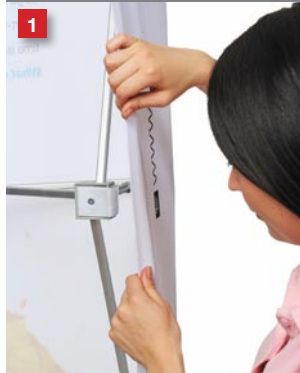
1 Remove the ends with the velcro tape