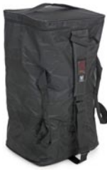
Extra Carrying bag, Item 5058

4x3, item 82228 3x3, item 82227 2x3, item 82226