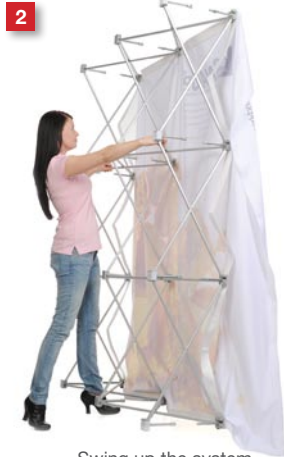
2 Swing up the system