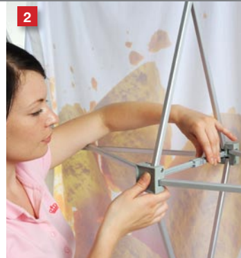
2 Unlock all hubs and fell the system together