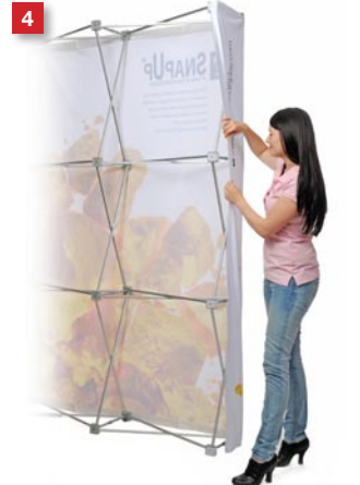
4 Attach the ends with the velcro tape