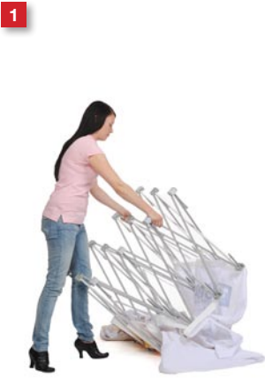
1 Grip the structure over the second row of hubs